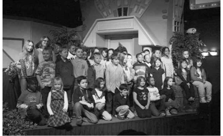
They are precious in His sight: group photo of the children who were baptized at Tree of Life Ministries