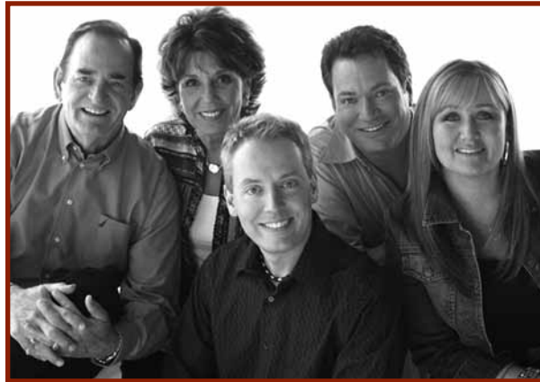
The Hoppers Special Guests June 15 – Evening Celebration Service