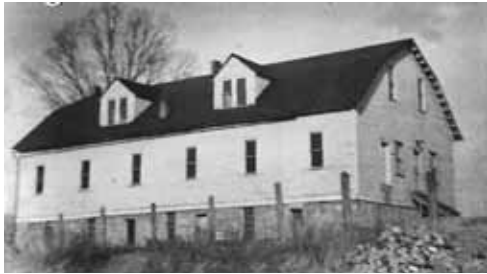
Tabernacle on the Hill Montcalm, West Virginia

Historically, in the late 1800s and the early 1900s, the Holy Spirit was moving in a powerful way from Europe to the West Coast of California. In the United States, from Maine to California, the power of Pentecost was spreading like a fire energized by wind.