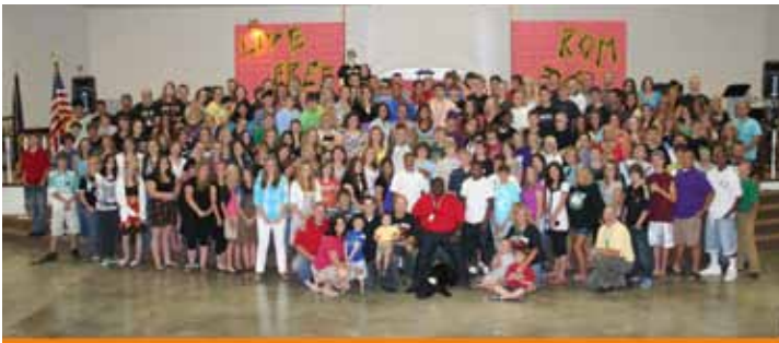
Extreme Teen Week