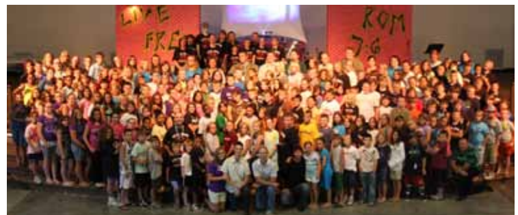
Adventurer Pre-Teen Camp