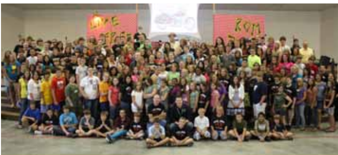
Destiny Junior Teen Camp

Again, we thank God for the power, provision and presence of the Holy Spirit that drew young men and women at an appointed time into relationship with Him to Live Free!