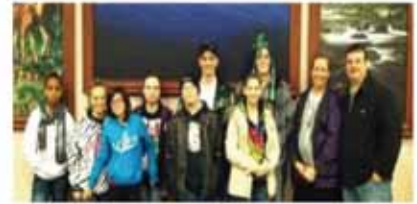
RAY OF HOPE