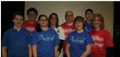
VALLEY HARVEST MINISTRIES