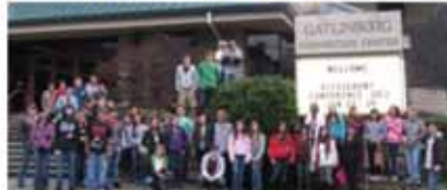
CHRISTIAN LIFE INTERNATIONAL