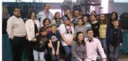
TREE OF LIFE MINISTRIES