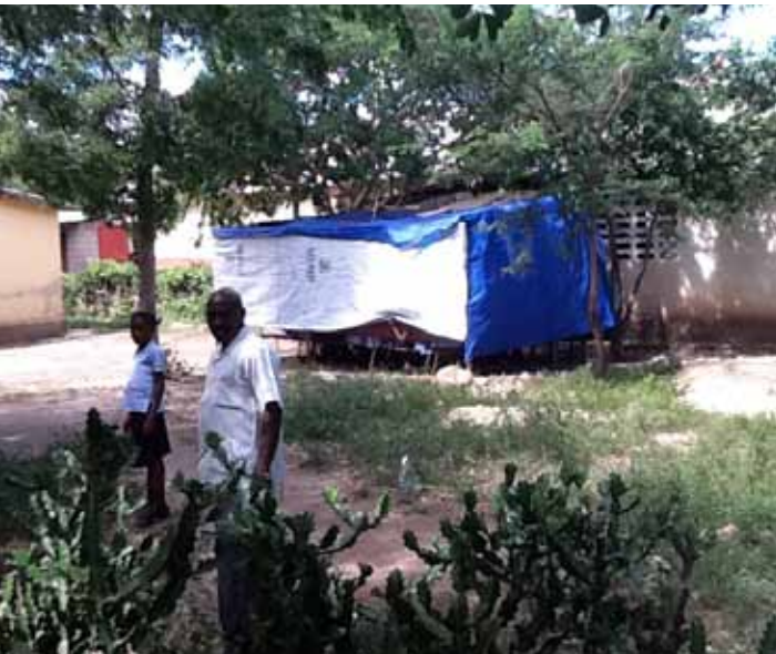
PHC People to People students in Tapio, Haiti, have to use an outside classroom (under the tarp) due to lack of facilities. A building and medical team from the conference will arrive to help this situation February 23–March 1. Thanks for your prayers!

What are you waiting for? The clock is ticking!